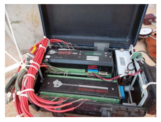
Strain Gauge Leads Connected To Data Logger

For all eight load tests, readings of strain gauges and pile toe telltale displacement gauges were taken automatically by a data acquisition system. Automated readings of pile head displacement gauges, and load was carried out through a separate dedicated Fugro pile testing data logging system.