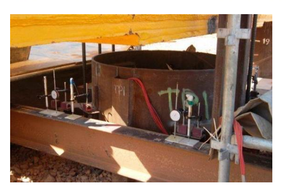
Typical Setup of Displacement Gauges

Load was applied to the test pile and the reaction frame simultaneously bv pressurizing a single 15,000 KN jack. The force applied to the reaction frame during the loading of the test pile was transferred to the four reaction piles through 32 mm diameter Dywidag bars system. A stress limit of 50% of the ultimate strength of the Dywidag bar was taken in the design to limit elongation and more importantly ram stroke in the hydraulic jack and allow for non-uniform distribution of loading and to enable re-use for follow-on tests. With the safety of the reaction setup being of utmost importance, the upward movement of the reaction beam was checked at each load increment using a digital level. Reaction pile movement was monitored by the Subcontractor.