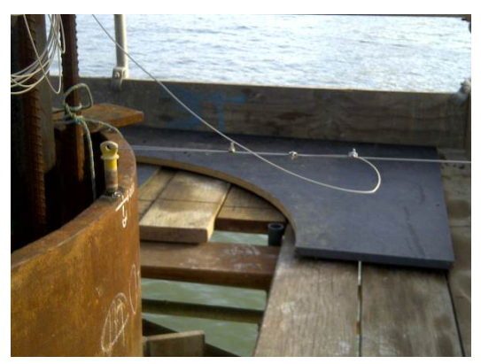
Measurement of Pile Deflection Using LRDM

Two test piles were simultaneously subjected to a maintained lateral load test to monitor pile deflection and pile shaft bending strain under lateral load. As each pair of strain gauges needed to be aligned to the direction of loading, care was taken during reinforcement cage installation. Pulling the two test piles together utilizes the reaction of one pile against the other. The loading setup comprised four cylinder jacks bolted to a reaction frame, connected to a collar on each pile. This setup provided suitable load capacity and ram stroke capability for lateral movement of up to 800 mm for each pile. With safety being of paramount importance, each jack was fitted with a one-way valve to prevent any untoward incident due to a sudden loss of pressure.