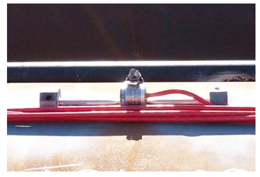
Strain Gauges Fixed To Test Piles

Named after the classical Greek word for "fish", gas from the Ichthys gas field will be transported through a subsea pipeline more than 885 km along to an onshore LNG processing facility at Blaydin Point, Darwin, Northern Territory. The site development civil works package included an advance pile testing program which called for both axial compression and tension load tests, lateral load tests and strain gauge instrumentation.