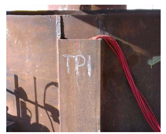
Strain Gauge Protection Channel

The first phase of work involved the fixing of Geokon Model VSM 4000 strain gauges to the steel pile elements. The test piles were to be installed by driving method using an impact hammer so the continued operational integrity of the gauges after driving was of utmost concern. A length of channel section was also used to protect the gauges and instrument cables during pile installation.