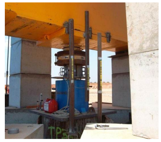
Arrangement of Jack and Load Cells

The load testing program was extremely tight but all equipment was delivered in time to commence the setup for the first test on schedule. Of the five test piles, three were specified to be loaded in axial compression. Reaction beams, load application and measurement devices were setup by the Subcontractor to the layouts provided by Fugro.